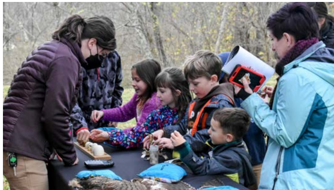
Exhibits to touch...