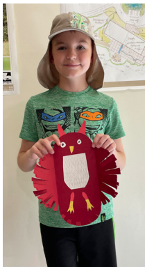
Crafts to make...