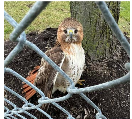
Hawk prior to capture

Fingers crossed that this beautiful hawk can make a full recovery. Many thanks go to the original finders of the hawk for notifying us of the injured bird and its location.