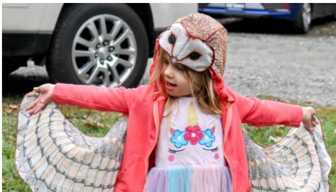
Wings to try on...