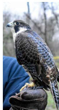
Falcons to admire.

Nearly 1,500 attended our 9 Open Houses, enjoying the docent-led activities and tours of our education ambassadors.