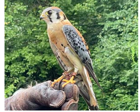
RAPTOR Inc. was thrilled to give forever homes to two new educational ambassadors, Hera, a great horned owl, and Noah, an American Kestrel.